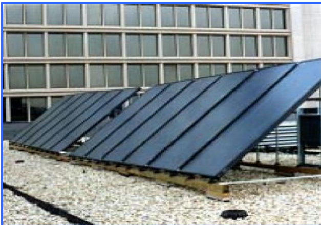
Solar Thermal Array

A solar heating system saves energy, reduces utility costs, and produces clean energy.